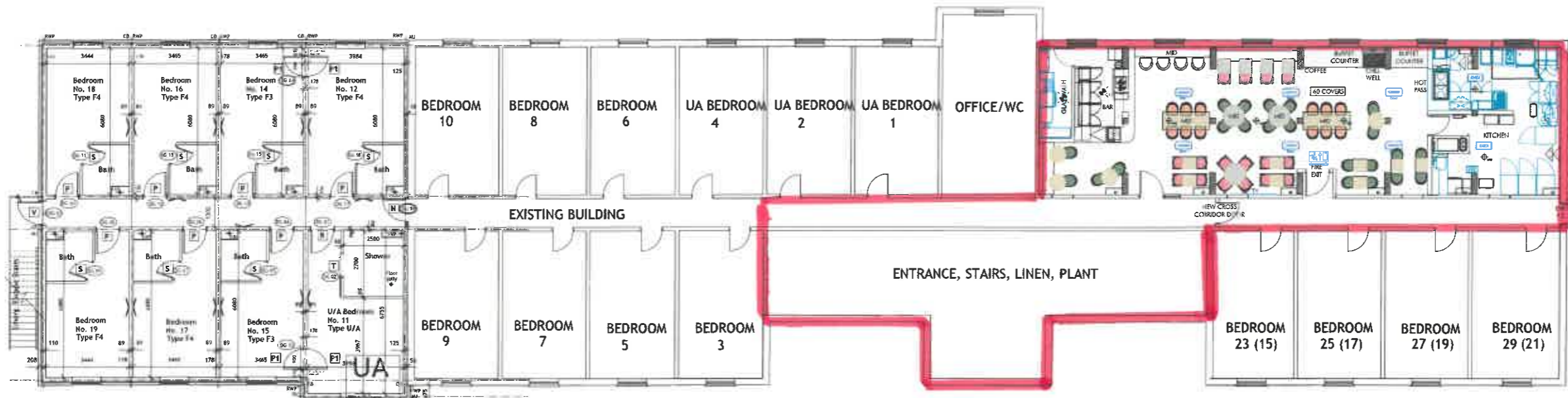
GROUND FLOOR LICENSING PLAN SCALE 1:100 @ A1